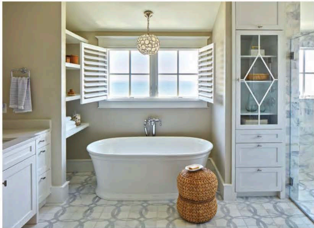
Above: The premiere bath is one of the home's most detailed spaces, featuring Pearl White Ribbon wet jet mosaic floor tiles, Arabescato Carrara honed marble shower tiles, a vanity from Decor Cabinets, mirrors from Williams Sonoma and Sherwin-Williams Gossamer Veil paint.

grasscloth wallcovering (from Phillip Jeffries). "The double-frame gives it a little bit of character," Oursler points out. The white oak flooring throughout the home keeps things neutral and calm. The living area's open floor plan not only flows easily to the bar, the coffee bar and the kitchen but also maximizes the views from multiple vantage points. The Andersen sliders on either side of the room (leading to the screened-in porch and the oceanfront deck) fill the space with sunlight. Light was also key to the positioning of the bedrooms. The clients' previous home, though set on the same land, managed not to feature ocean views from the bedrooms. This home boasts ocean views from four bedrooms, including the premiere, which is tucked cozily under the fourth-floor eaves with interior architecture detailing that emphasizes the roofline of the home. The bed's tufted headboard, backed by a bedwall of reclaimed wood, signals the home's values of comfort and unpretentiousness. In the premiere bath, even the glassed-in shower enjoys stunning ocean views. That's because Oursler understood the assignment. DT