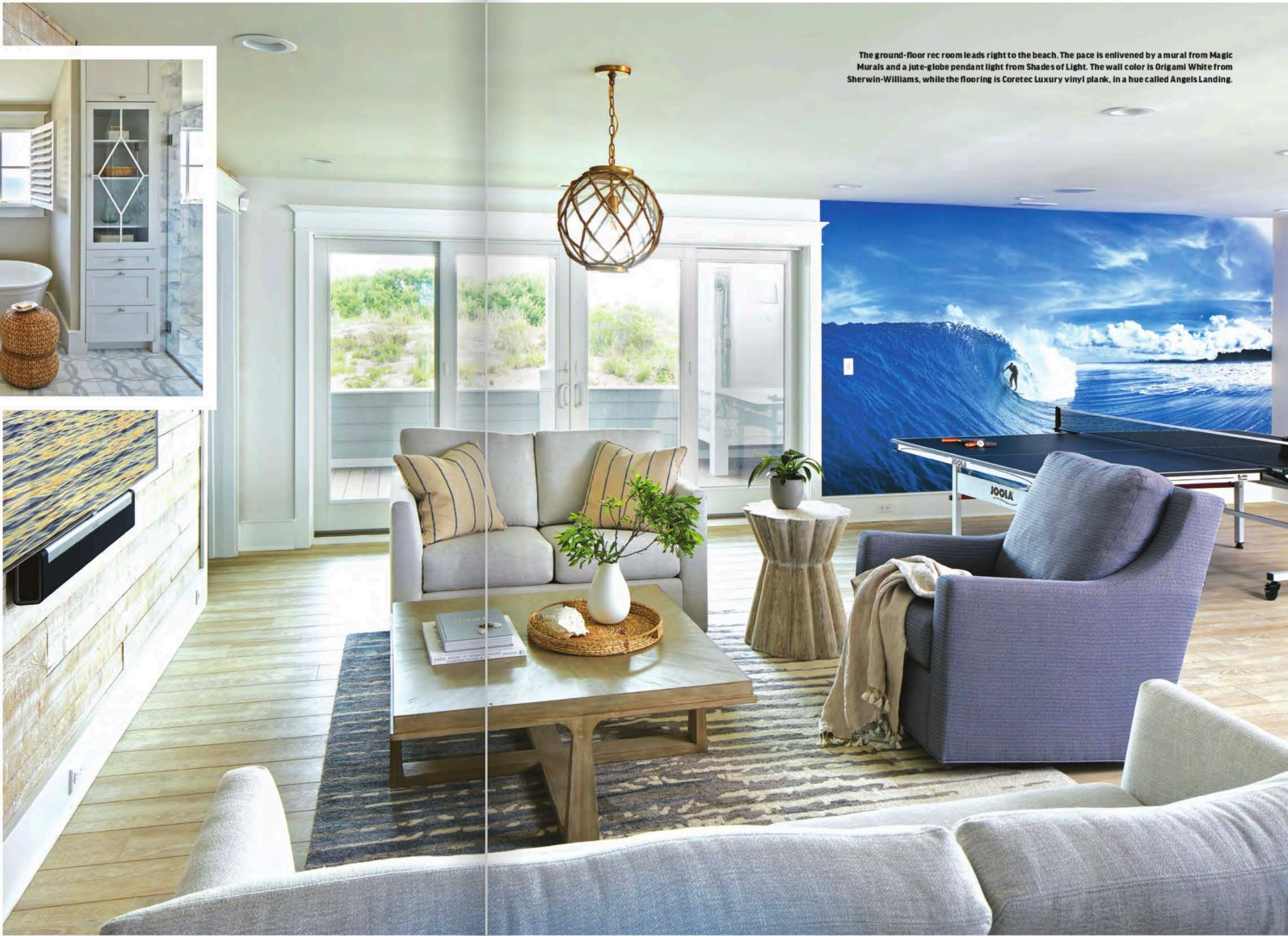
The ground-floor rec room leads right to the beach. The pace is enlivened by a mural from Magic Murals and a jute-globe pendant light from Shades of Light. The wall color is Origami White from Sherwin-Williams, while the flooring is Coretec Luxury vinyl plank, in a hue called Angels Landing.

grasscloth wallcovering (from Phillip Jeffries). "The double-frame gives it a little bit of character," Oursler points out. The white oak flooring throughout the home keeps things neutral and calm. The living area's open floor plan not only flows easily to the bar, the coffee bar and the kitchen but also maximizes the views from multiple vantage points. The Andersen sliders on either side of the room (leading to the screened-in porch and the oceanfront deck) fill the space with sunlight. Light was also key to the positioning of the bedrooms. The clients' previous home, though set on the same land, managed not to feature ocean views from the bedrooms. This home boasts ocean views from four bedrooms, including the premiere, which is tucked cozily under the fourth-floor eaves with interior architecture detailing that emphasizes the roofline of the home. The bed's tufted headboard, backed by a bedwall of reclaimed wood, signals the home's values of comfort and unpretentiousness. In the premiere bath, even the glassed-in shower enjoys stunning ocean views. That's because Oursler understood the assignment. DT